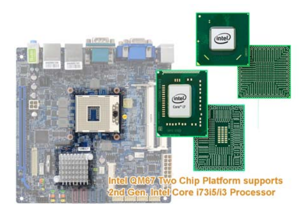
Figure Above: MX67QM mini-ITX motherboard is a two chip platform supporting 2<sup>nd</sup> generation Intel® Core<sup>™</sup> i7/i5/i3 processors

Mainstream and intelligent digital signage systems normally used to deliver rich 2D, 3D, HD video, HD audio contents and rich user interactivities such as multi-user, multi-touch and real-time motion sensing and demographic capturing/analyzing technologies. To handle such complicated applications simultaneously the system will require multi-core processing performance and faster data communication capabilities between the processor, memory and storage. The MX67QM supports 2<sup>nd</sup> generation Intel® Core™ i3/i5/i7 processors and DDR3 memory modules.