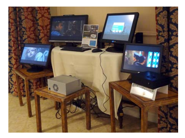
Figure Above: Live Demo Unit presented at the gaming conference in Las Vegas, 2011. BI355-67QM Industrial Computer (MX67QM mini-ITX motherboard inside) with Intel® Core i7 processor supports four monitors playing different HD content.

higher end industrial motherboards can support at least two onboard videos through the HDMI, DVI, VGA and LVDS connectors. The MX67QM mini-ITX motherboard supports the dual independent display feature. Moreover, the MX67QM motherboard is able to support onboard graphics and PCIe graphics simultaneously allowing two additional independent video outputs to be supported through the PCIe x16 expansion slot for a total of four simultaneous independent displays.